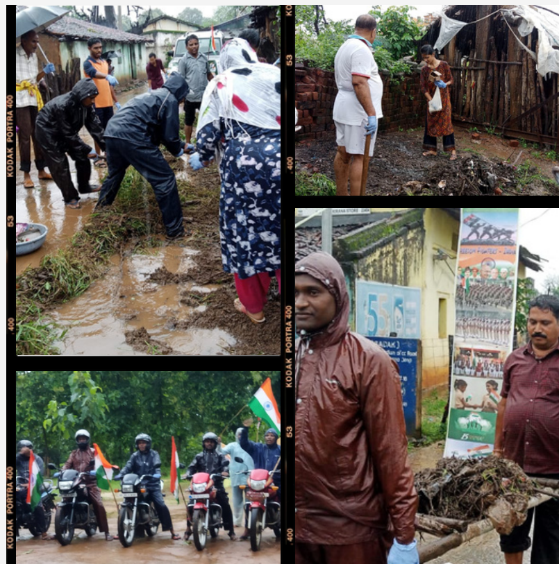
Independence day observation with Sanitation Drive