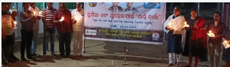
Peace Appeal and Prayer for Persons Suffering from War in Russia, Ukraine