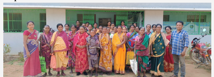
Association of single Women

Capacities of Panchayati Raj Institutions expanded, enabling effective policy and programme implementation